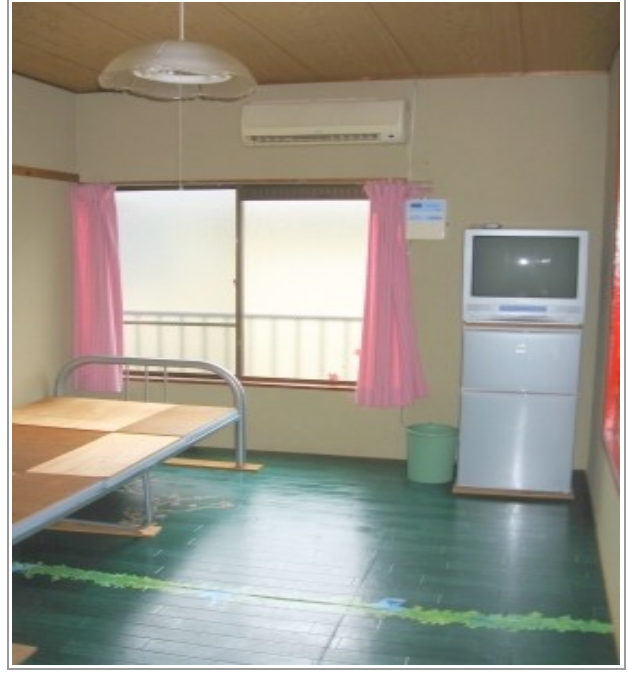
Room facilities : TV, Fridge, Closet, Bed frame, Free internet line, Curtain